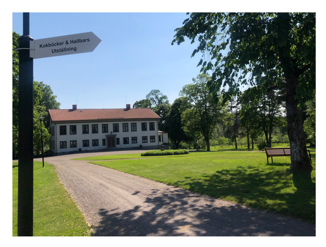
Photo Cookbooks and Sustainability road sign in Swedish, in front of Alfred Nobel House