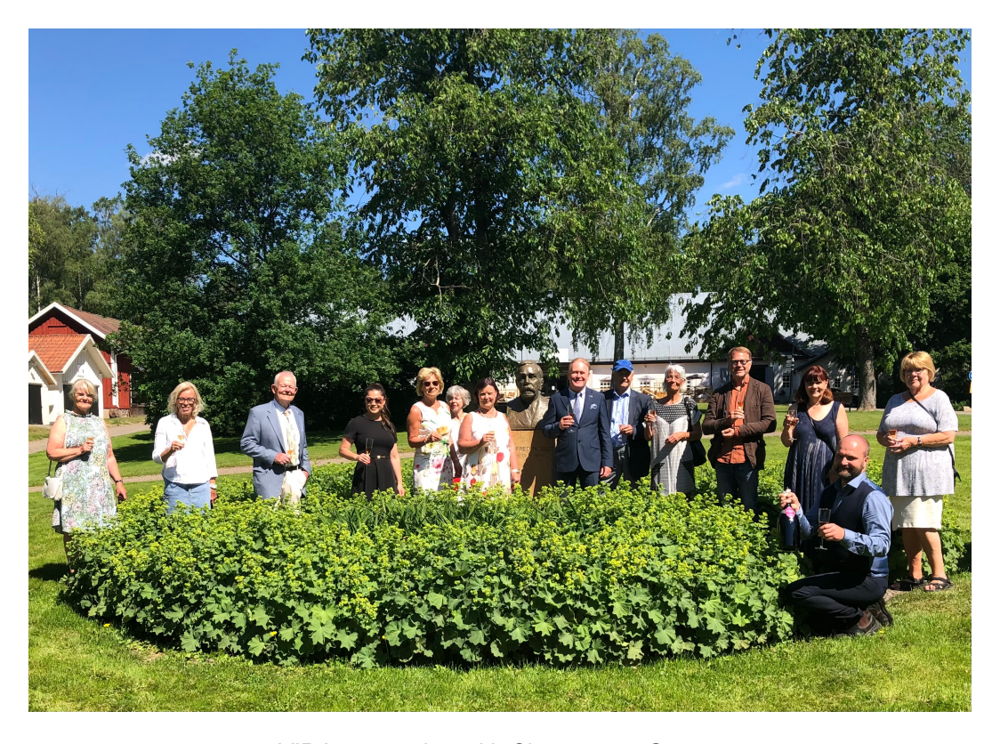
VIP Inauguration with Champagne Gosset